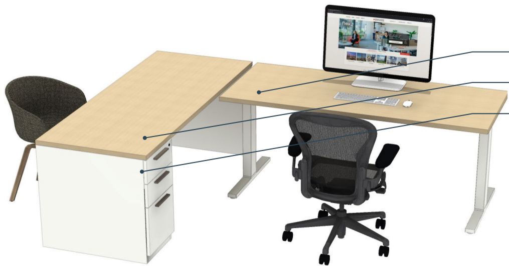
Height Adjustable Desk (72"W x 30"D)