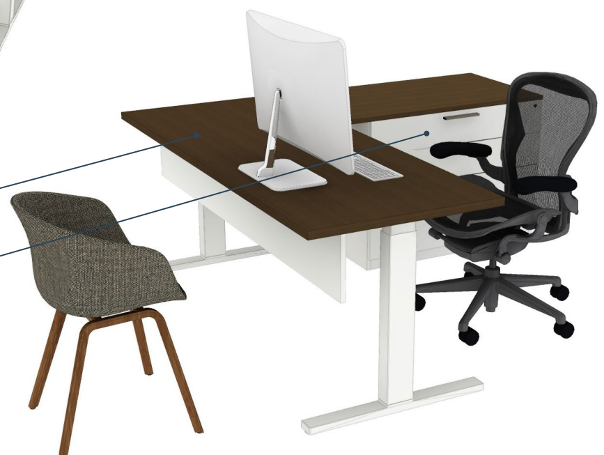
Height Adjustable Desk (72"W x 30"D) with Modesty Panel