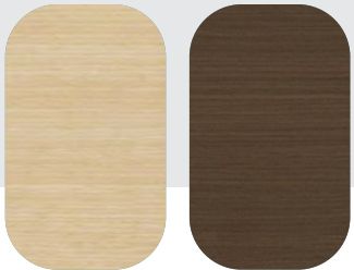
Ash Finish Walnut Finish